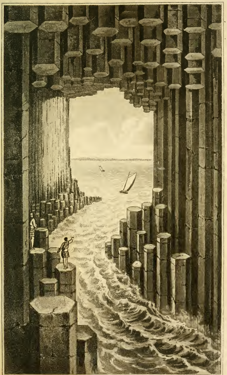
B. Rend Souin!